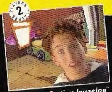
Club 3DO: Station Invasion™

Eleven Hot Titles! This Shouldn't Hurt...Much.